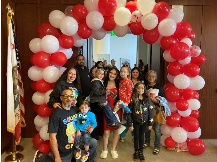
Post adoption family celebration!