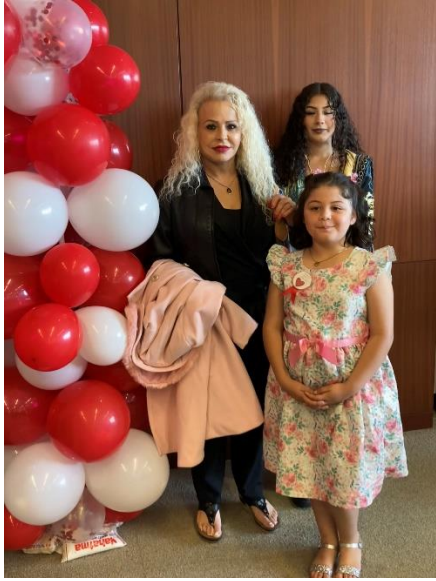
An adoptee with her forever family.