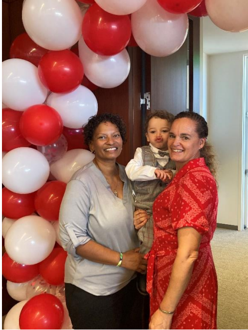
Child with adoptive parents.