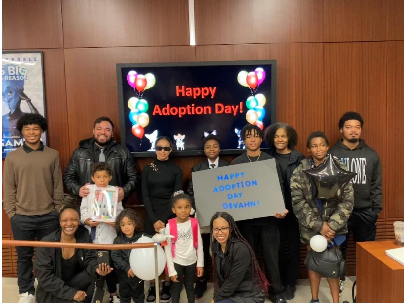
“Happy Adoption Day” Family Photo