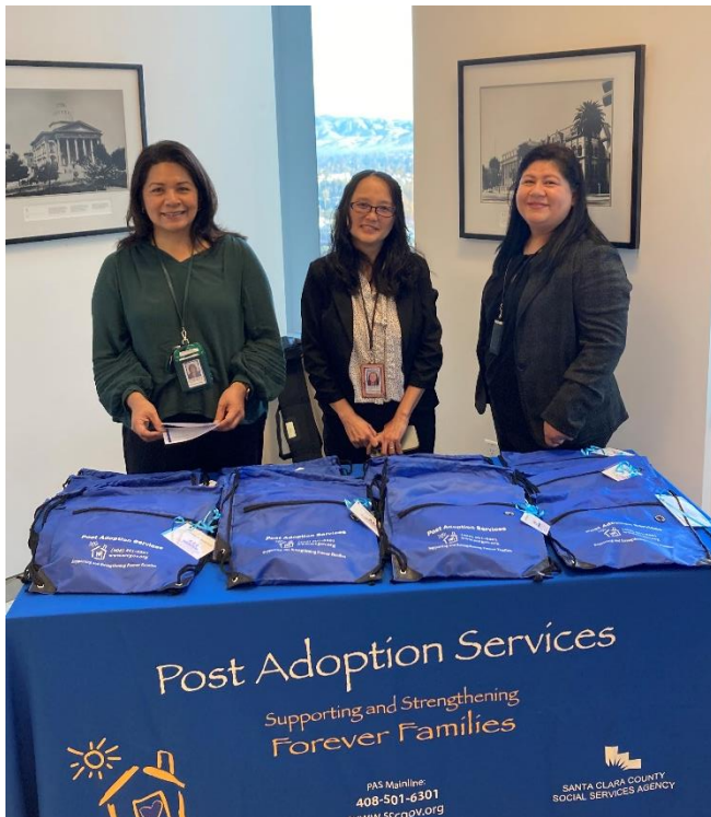
Community partner agency representatives