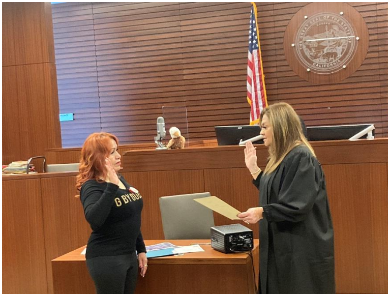
Hon. Rebeca Esquivel-Pedroza giving the Adoptive Parent Oath.