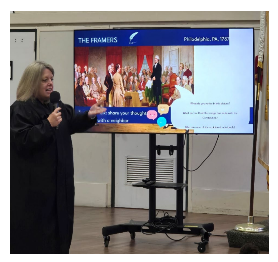
Figure 3- Constitution Month allows students to engage with history from their perspective, offering the opportunity for dialogue with a judicial officer.