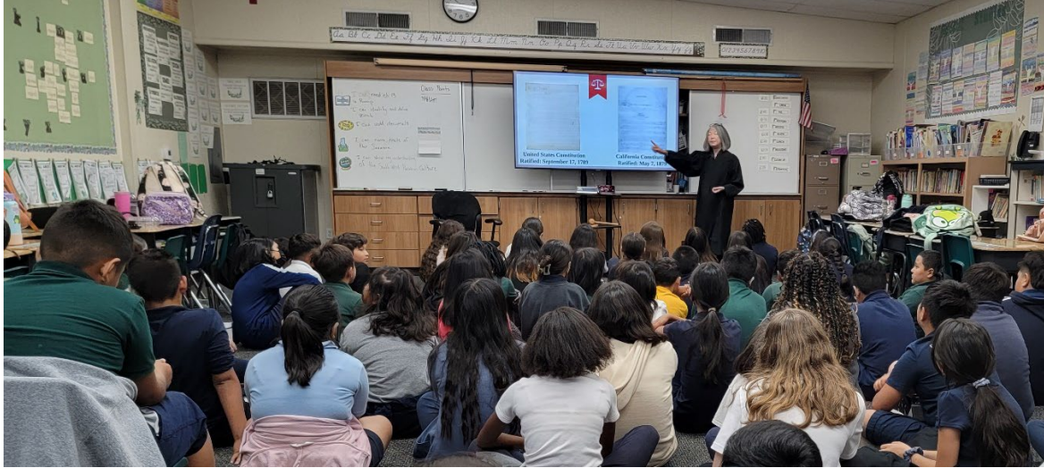
Figure 3- Hon. Roberta Hayashi with a class of eager 5 th grade students.