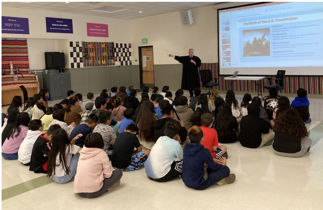
Figure 1- Hon. Christopher Rudy discussing the origin of the U.S. Constitution.