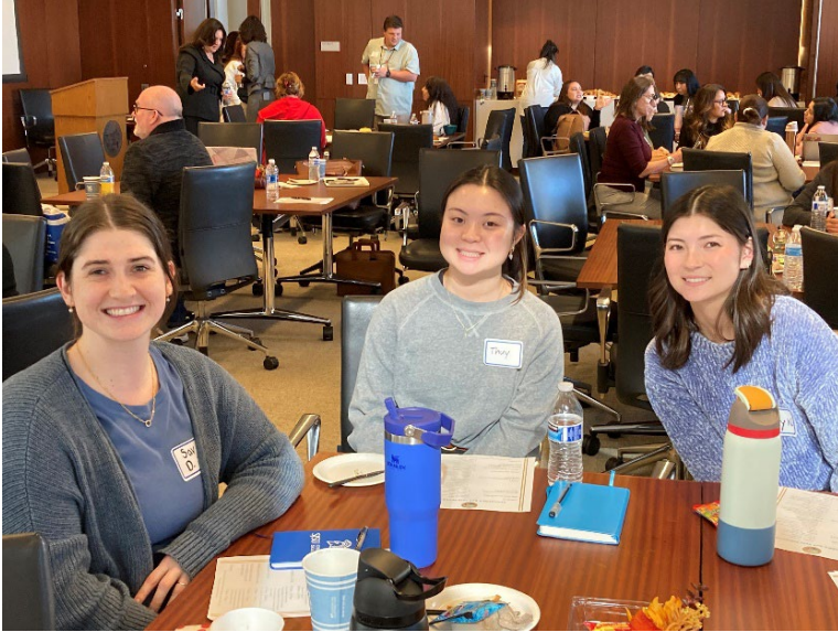
Figure 5- Santa Clara County's Educators