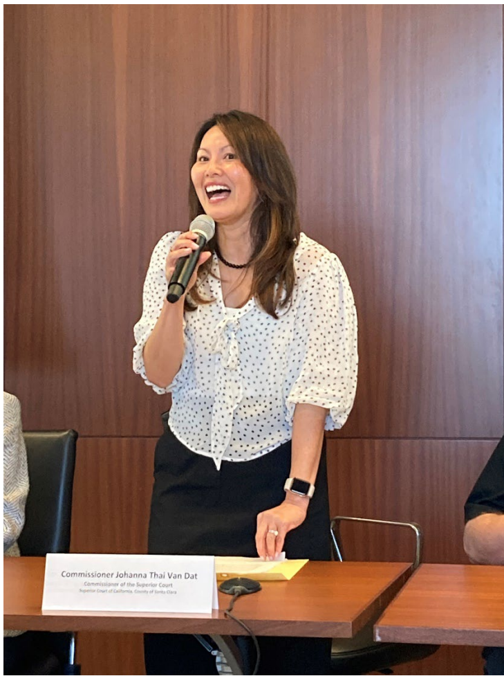
Figure 2- Commissioner Johanna Thai Van Dat, Moderator of the "Restraining Orders & Cultivating Healthy Relationships" panel