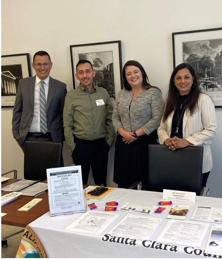
Figure 7- Representatives from the County of Santa Clara providing information on behalf of the Resource Panel