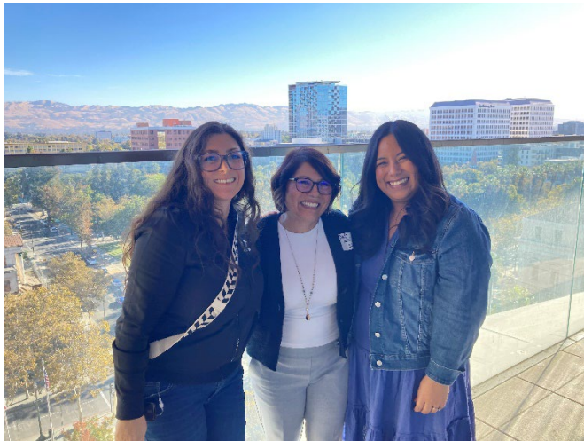
Figure 10- Santa Clara County's Educators