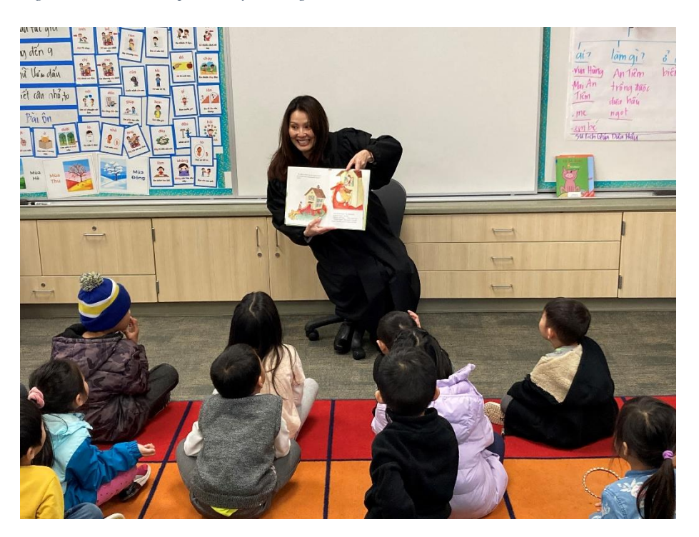
Figure 3- Commissioner Johanna Thai Van Dat promoting the importance of kindness with kindergarteners.