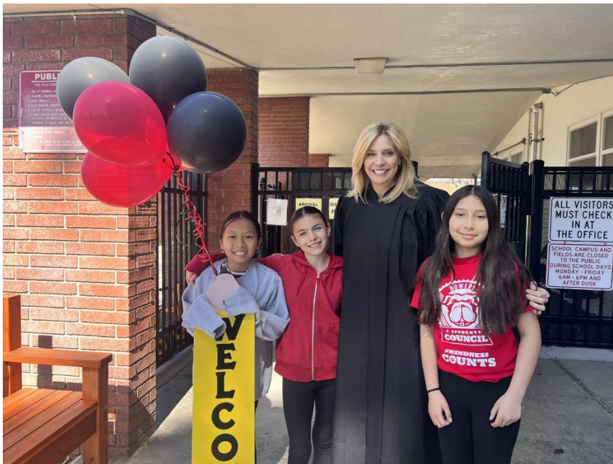
Figure 8- Hon. Johnene Stebbins receiving a warm welcome from Bowers Elementary School students.