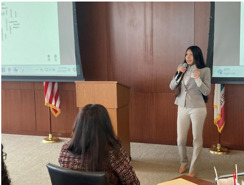
Figure 3- A student from Yerba Buena High School offering insight into her personal experience and empowering her peers to believe that they can accomplish their dreams and goals.