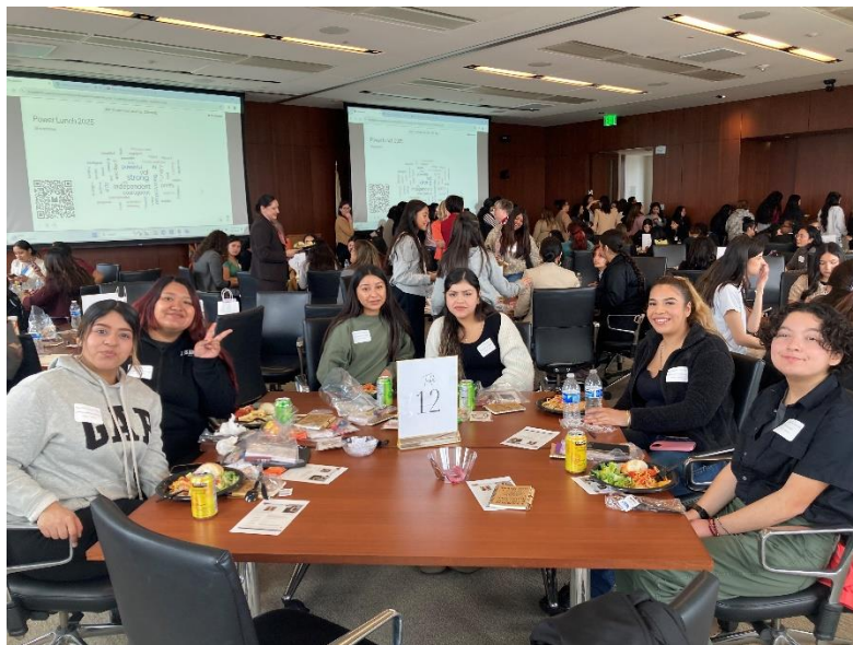
Figure 7- The room was brimming with excitement and high expectations for an uplifting event.