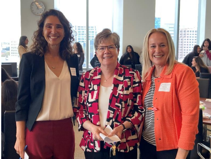
Figure 2- Hon. Julia Alloggiamento, Presiding Judge Julie Emede, and Hon. Kelley Paul.