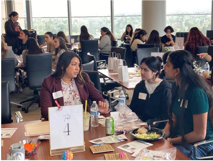
Figure 8- A mentor offering insightful advice to high school students.