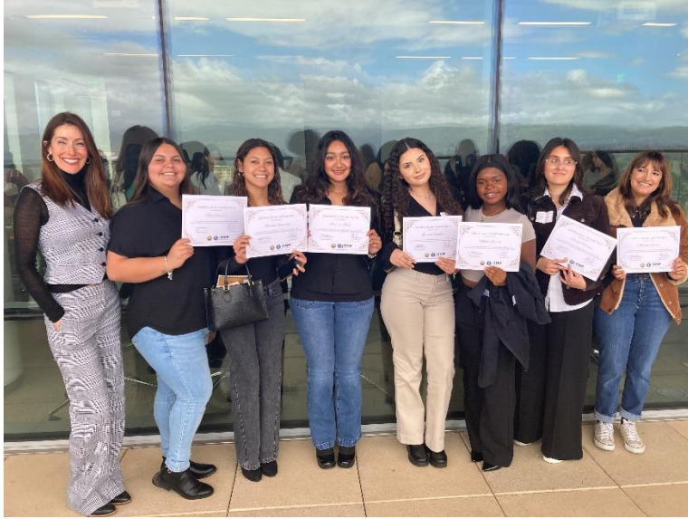
Figure 4- Youth with their designated mentor and certificates of participation.