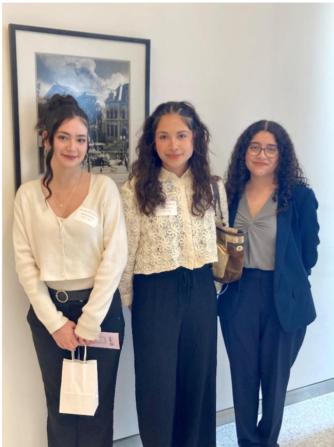
Figure 9- Attendees photographed upon arrival for the luncheon.