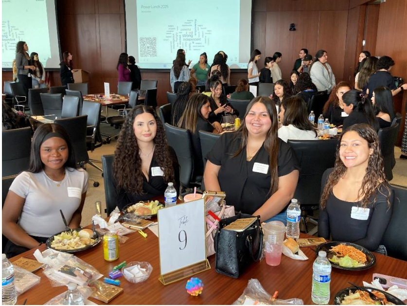
Figure 10- Empowered young women.