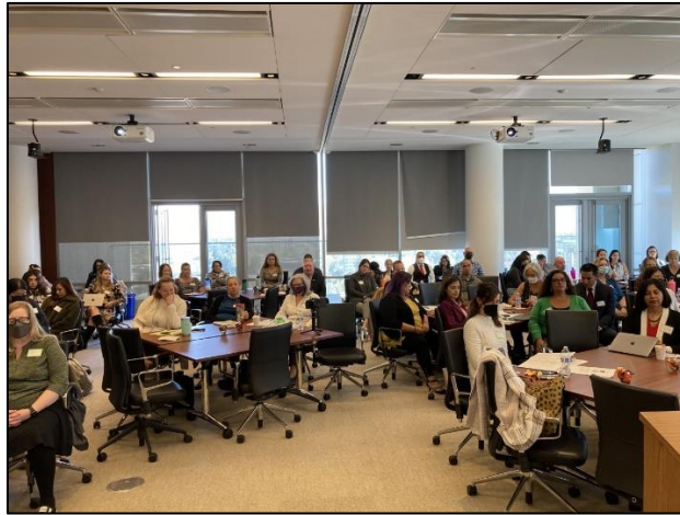
2022 Attendees of Educators Day at the Court