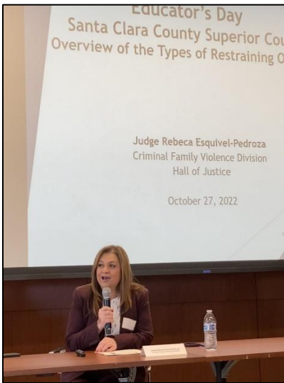
Judge Rebeca Esquivel-Pedroza, Criminal Family Violence Division